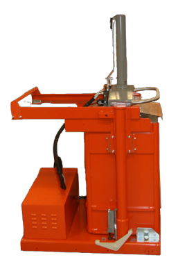
Mounted on wheels for easy manoeuvring when cleaning